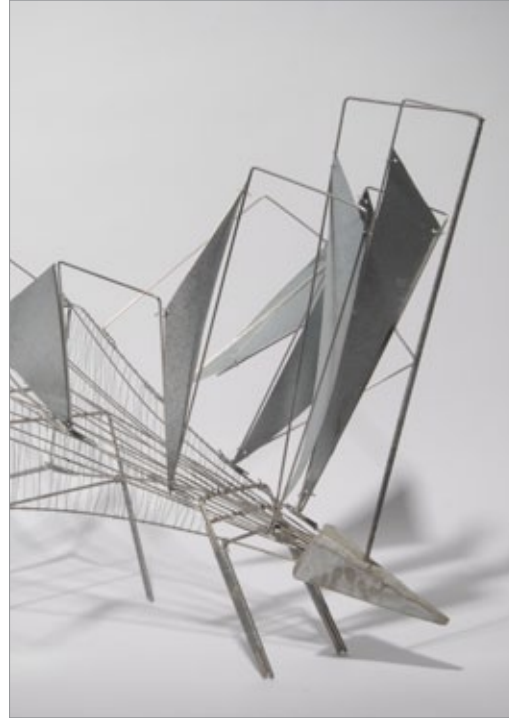
Student own description/ concept.