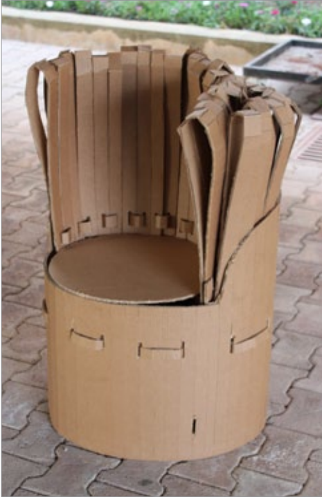
Description of the Studio