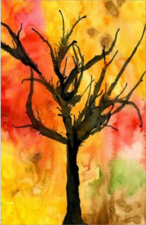
Description of the Studio