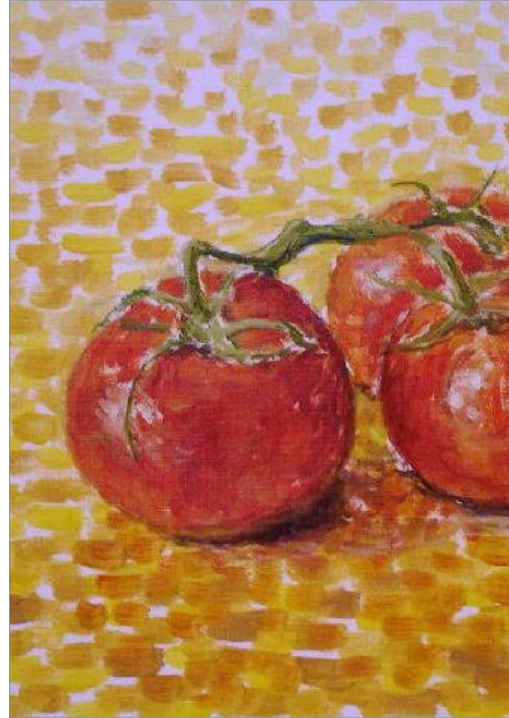
Student own description/ concept.