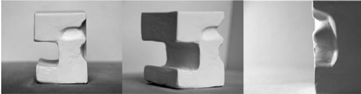
View of Project