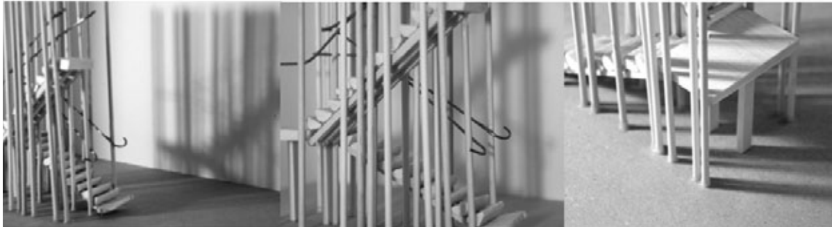
View of interior space